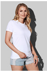
ST2160 Comfort-T 185